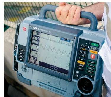
Dual-mode LCD screen with SunVue display